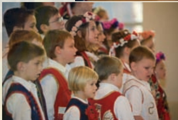
The Polish Children's Choir from St. Stanislaus Church sang traditional Polish songs and carols.