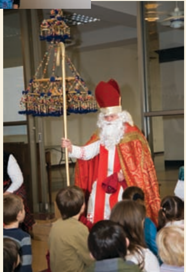
Above: Children learn about the "Legend of St. Nicholas" at the Saint Nicholas Day program held on December 6.