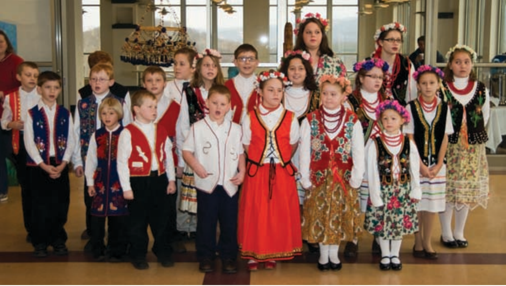
The Polish Children's Choir from St. Stanislaus Church sang traditional Polish songs and carols at the St. Nicholas Day Program in conjunction with the Schulman Gallery Crayons & Care exhibit.