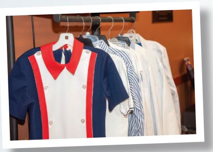
Nursing uniforms over the years