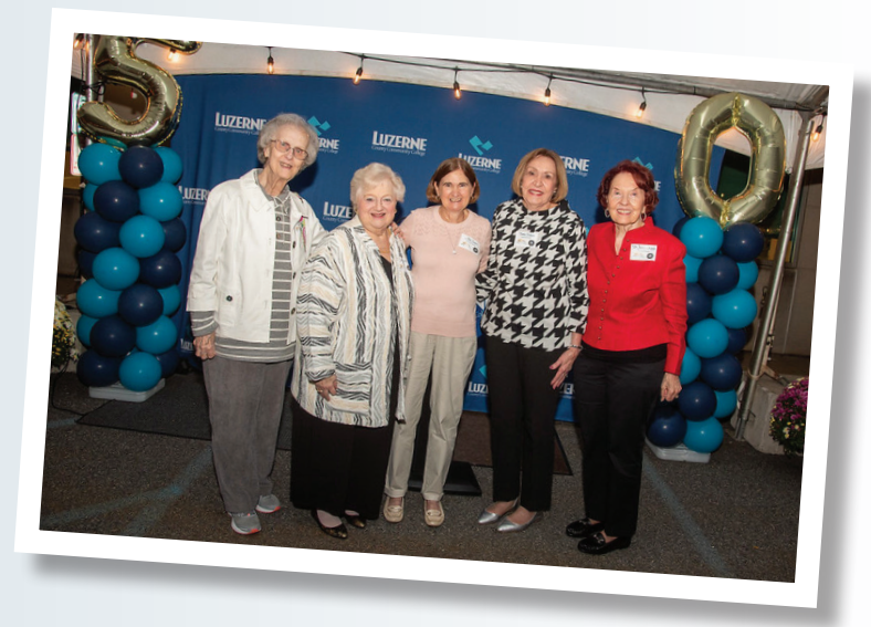
Several retired faculty members attended the festivities.

A digital slideshow was shown on the monitors and 1st floor lounge depicting LCCC's Nursing program over the past 50 years. Along with demonstrations from each of the different programs, many attendees visited the nursing memorabilia and the hall of graduates nursing photos.