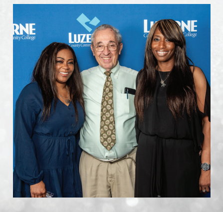
Scholarship recipients met with and dined with their donors at this year's 40th anniversary dinner.