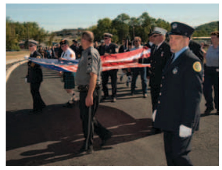
Local first responders carry the American Flag to its destination at the newly constructed Walk of Honor.