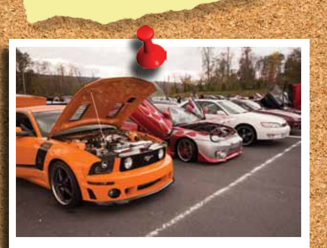
Hoods up at the year's DroptoberFest