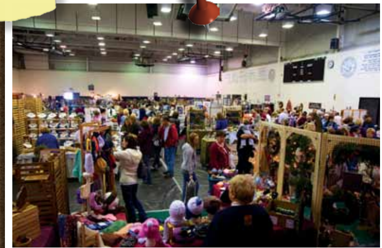
LCCC's Craft Festival had another great turnout this year with over 150 vendors