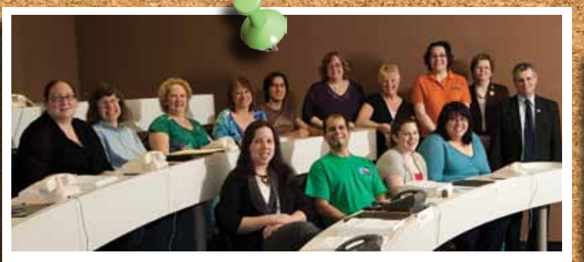
LCCC Alumni Association members, volunteers, and students staff the phones for the annual Phonathon