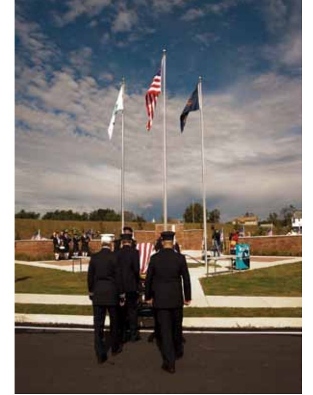
LCCC's 10th anniversary ceremony of 9/11 featured an artifact from the World Trade Center being placed in a monument at the Regional Public Safety Training Center on the campus of Luzerne County Community College, Nanticoke.

FEMA and various Pennsylvania state agencies helped over 1,500 families and businesses through the DRC.