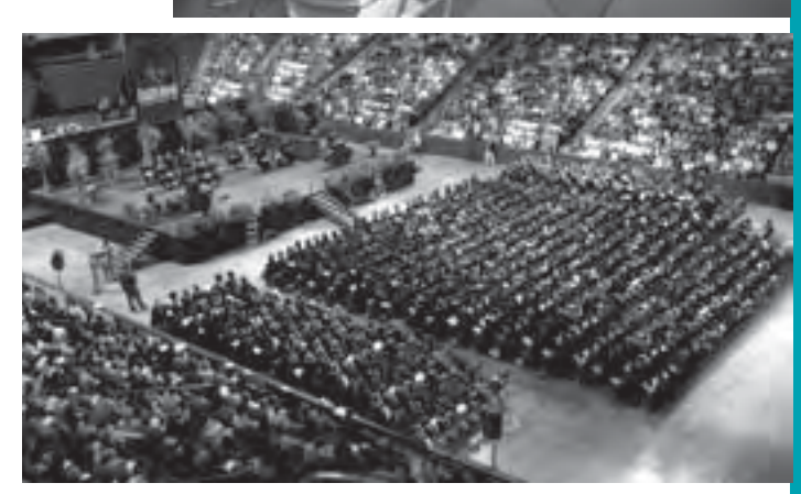
LCCC Graduation Class of 2005 at the Wachovia Arena (above)

Luzerne County Community College is the largest college in northeastern Pennsylvania and continues to expand and adapt to the educational needs of the residents and business and industry in the Wyoming Valley. The staff and faculty of LCCC will always continue our dedication to the students and alumni of northeastern Pennsylvania as we have over the past 40 years.