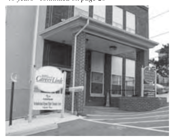
LCCC's Northumberland Regional Higher Education Center in Shamokin