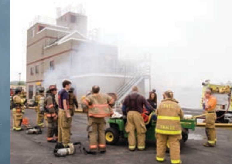
Tactical/structural firefighting tower/ burn building which simulates various types of fires.

Flannery says the Regional Public Safety Training Institute will host an open house for the community in the near future.