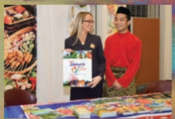
Participants at the exhibits opening look through Information on Malaysia and its culture.